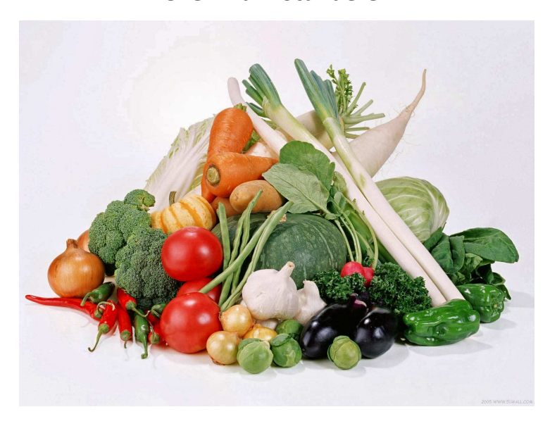
McCoard's Garden Center 384 S. 3110 W. Provo, UT 84601

Email: <a href="mailto:info@mccoards.com">info@mccoards.com</a> Visit our website at <a href="mailto:www.mccoards.com">www.mccoards.com</a> 801-373-1262